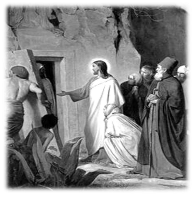
"... But even now I know that whatever you ask of God, God will give you."